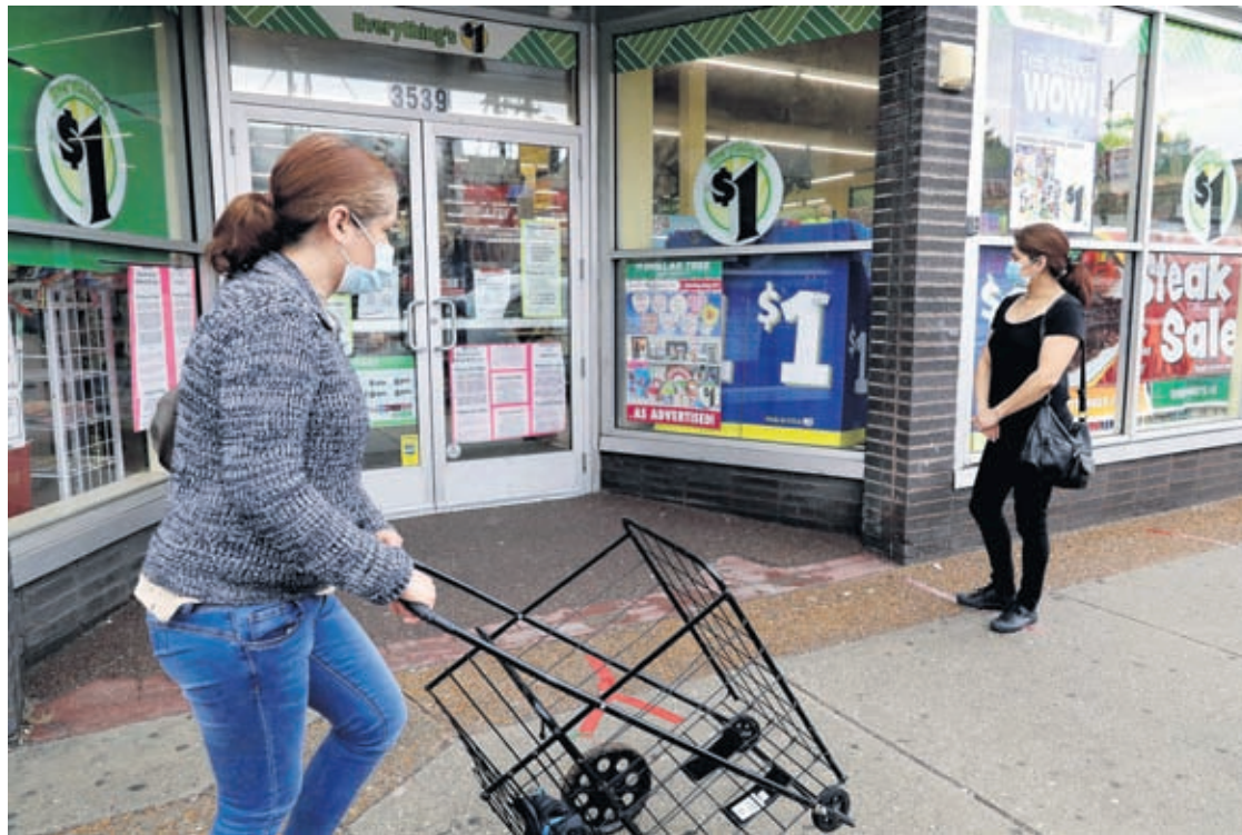
In this Friday, May 15, 2020, file photo, a woman wearing a mask, left, walks by a Dollar Tree, while another woman waits in line to shop at the store, which is limiting customers amid the coronavirus pandemic, in Chicago.

"I believe brands need to pay attention to the new